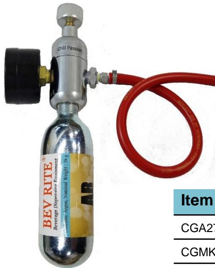
Mini Argon kit with Regulator and 2 Argon Cartridges