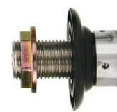
Jockey Box ID: 1/4" x 5/16" (for 5/16" coils) CP Brass or SS304