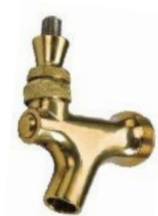
CFS36 - PVD Stainless Steel faucet SS 304