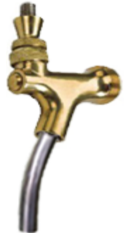
CFS37 - S PVD stainless Steel wine faucet with extended spout SS 304