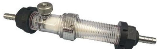
CF4200 Inline flow control valve. Order nipple and nut combo separate