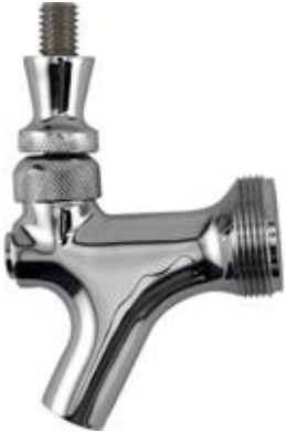
CFS304 - Stainless Steel faucet SS 304

Good for Wine, Liquor, Cider, Beer and Water