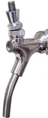
CFS310 - Stainless Steel wine faucet with extended spout SS 304