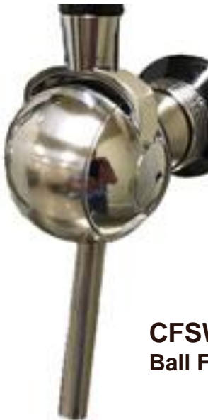
CFSW30 Ball Faucet for Wine.