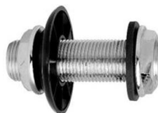
Beer Coil cooler wall coupling Chrome plated brass or SS304