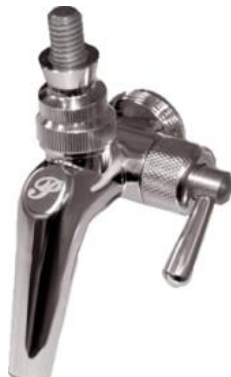
CPP650SS Perlick flow control faucet